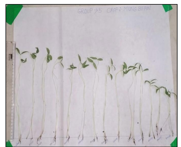
Fig.3 Effect of different doses of gamma irradiation on mean seedling height of Mung bean cultivar