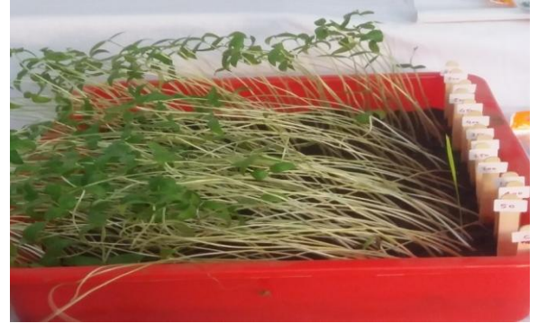
Fig.2 Effect of different doses of gamma irradiation on Mung bean seedling

Table.1 Effect of different doses of gamma irradiation on growth parameters